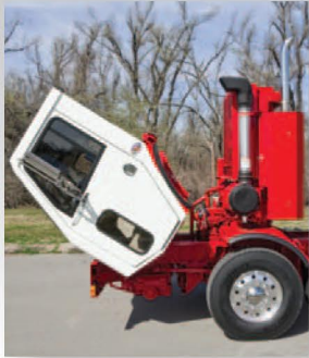
Cab Tilt for Engine Access