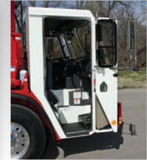
Large Door Opening