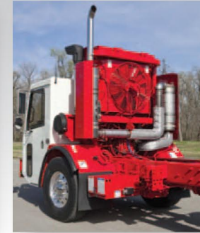
Remote Mounted Radiator