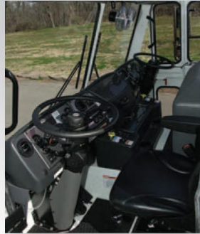
RH, LH or Dual Steering