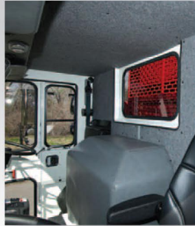
Spacious Cab Interior