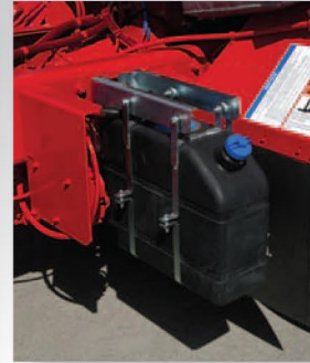
10 Gal. DEF Tank