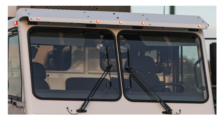
Large, flat, glass windshield; simple to replace and cost effective compared to complex, curved glass