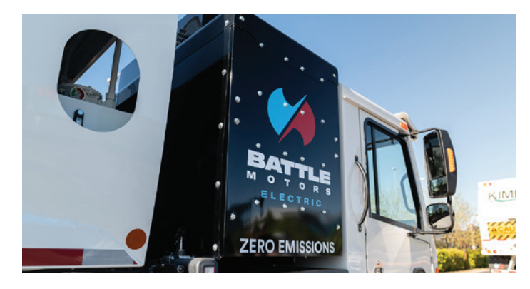
Remote mounted battery pack options in 240 kWh and 400 kWh