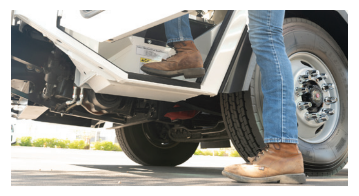
True low entry 18" step-in height on both sides