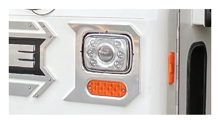
Standard LED projection headlamps