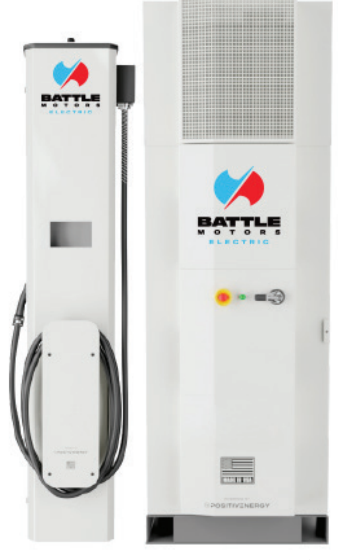
Dispenser Power Conversion System (PCS)

A: Up to 10 miles of driving distance per hour of charging with the 19.2kW, up to 25 miles with the 60kW, and up to 56 miles with the 125kW