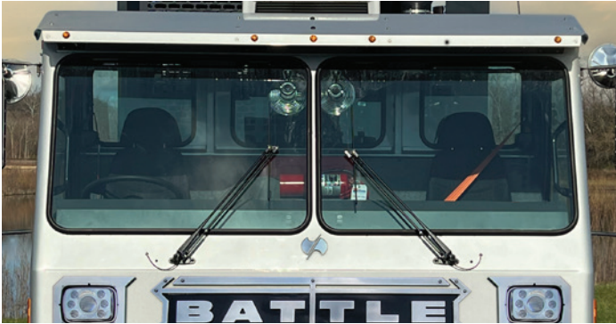
Large, flat, glass windshield; simple to replace and cost effective compared to complex, curved glass