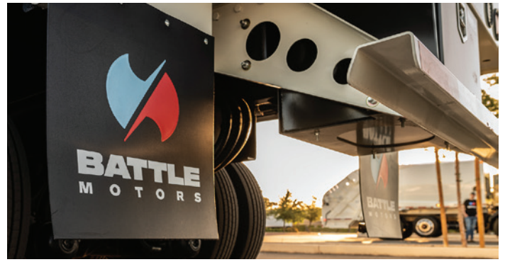
Cast steel, tubular crossmembers provide consistent strength fore and aft, side-to-side