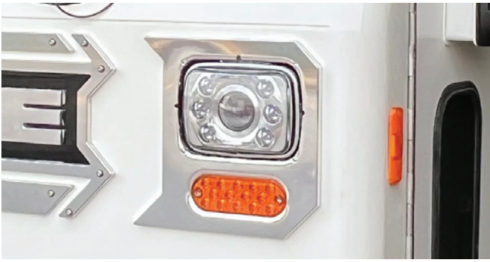
Standard LED projection headlamps