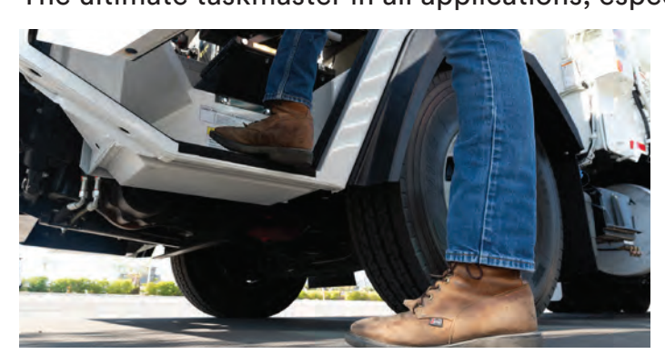
True low entry 18" step-in height on both sides

The Battle Motors LET II is a workhorse that incorporates sophisticated engineering and quality that is built to last. Designed to comfortably and safely transport a four-man crew, forward facing and with seat belts, the industry's lowest step in height and sets the bar in cab roominess. The ultimate taskmaster in all applications, especially in a rear loader refuse capacity.