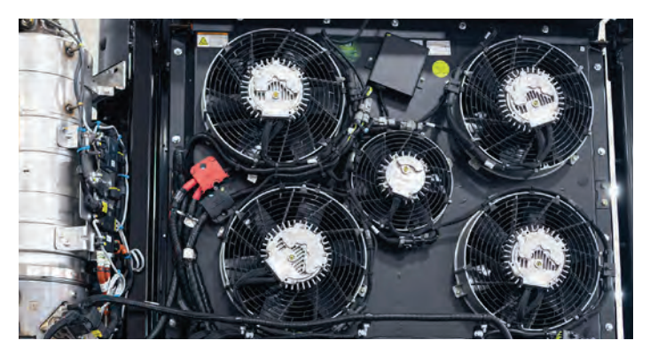
Remote mounted 1,814 square inch radiator produces quieter, cooler cab environment and allows for a pass through cab design