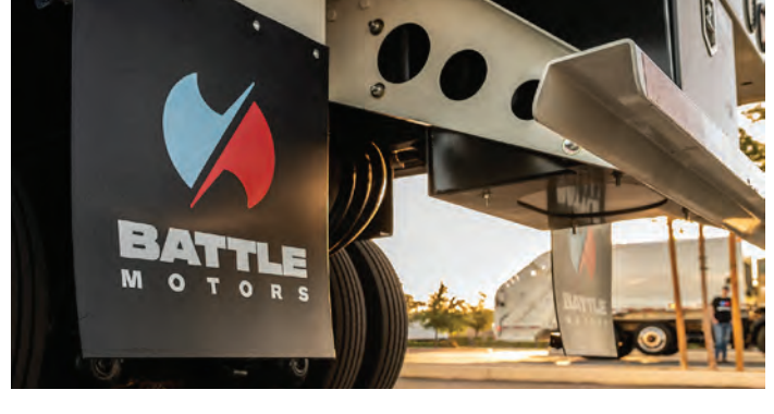
Cast steel, tubular crossmembers provide consistent strength fore and aft, side-to-side