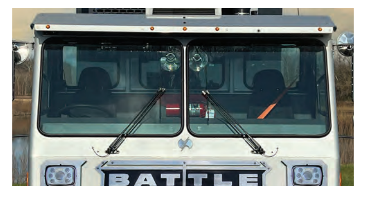
Large, flat, glass windshield; simple to replace and cost effective compared to complex, curved glass