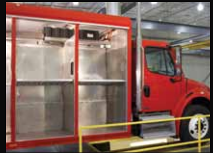
Drop-frame compatible chassis with partial inner-frame reinforcement simplifies body installation.

Visit your local Freightliner dealer for complete specifications and options.