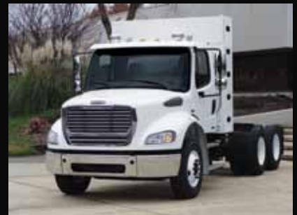
Consider going green with the M2 106 hybrid or the M2 112 natural gas tractor (shown).