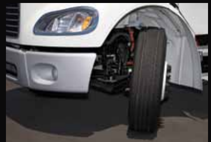
Industry-leading 55-degree wheel cut provides outstanding maneuverability to get you out of tight spaces easily.