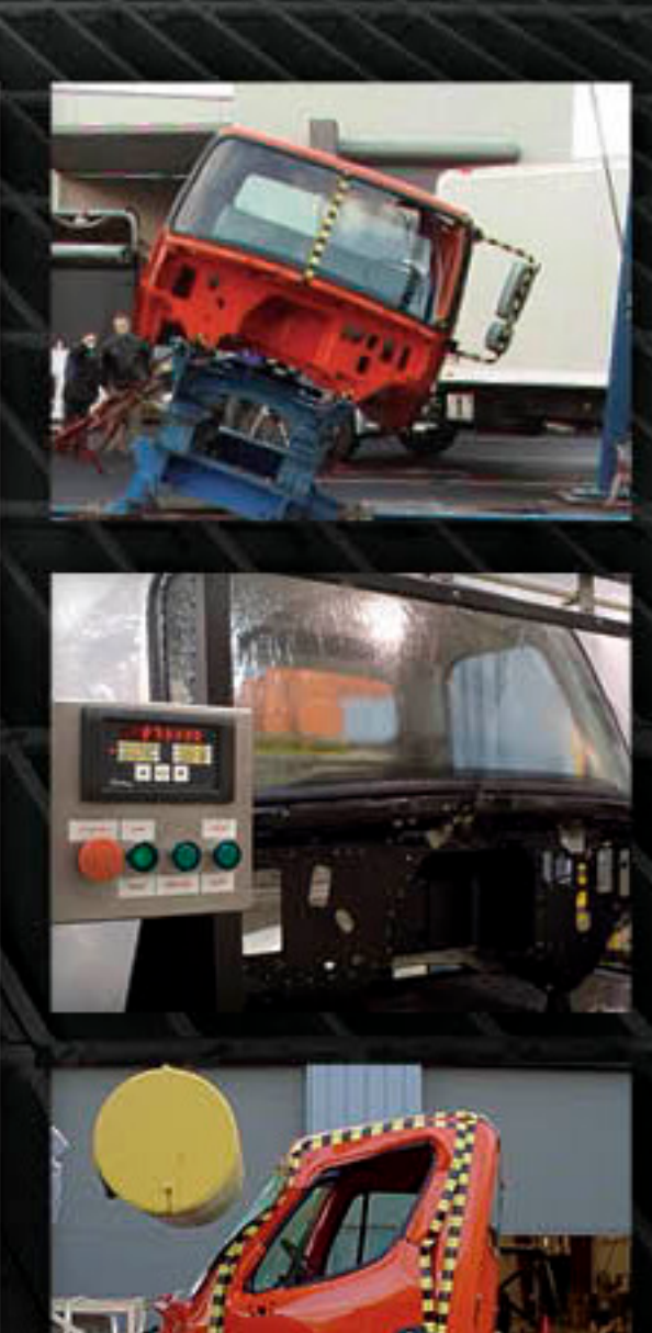
Components, systems and entire vehicles are subjected to an array of virtual and physical tests to ensure our trucks deliver the expected function, performance and reliability.