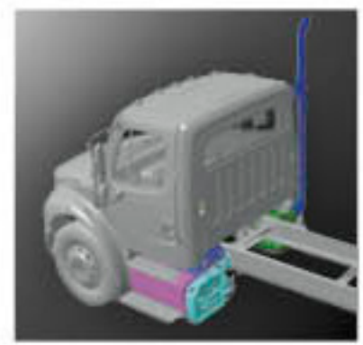
CLEAR BACK-OF-CAB TAILPIPE Clear left-hand and right-hand transmission PTO mounting locations