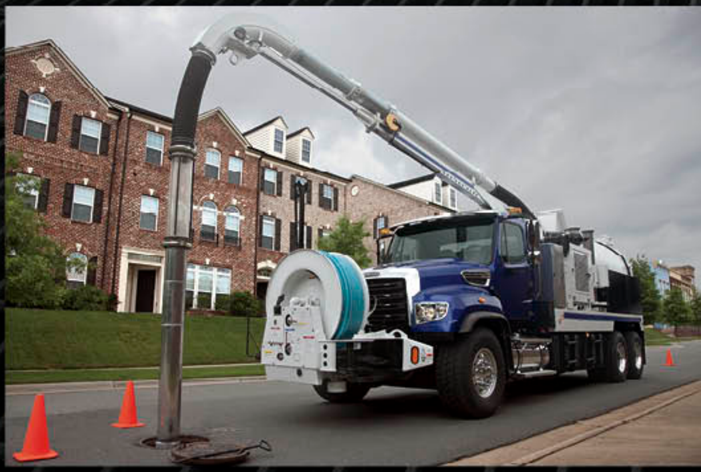
114SD Set-forward Axle

Fixing roads, plowing snow and responding to emergencies are all in a day's work. And citizens depend on their government to be prepared for these jobs and more. So wouldn't it be nice to have a fleet of tough and dependable trucks?