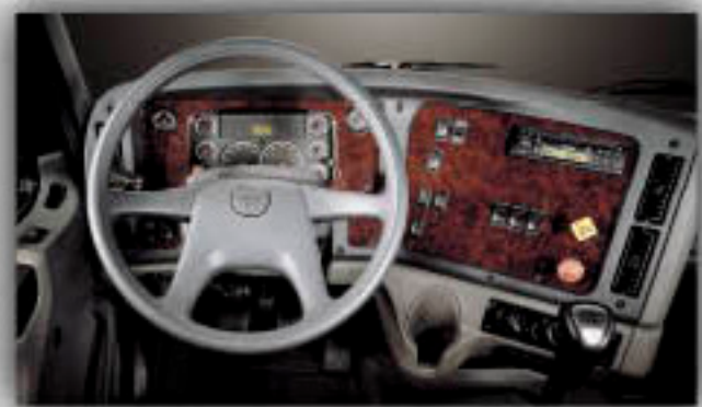
114SD wing dash and interior (above and above left)

When you step inside a Freightliner truck, you'll definitely understand what it means to work smart. The driver-friendly dash features controls and switches within easy reach of the driver. The analog gauges are backlit with LED lights for easy readability. And our SmartPlex™ Electrical System provides optimal switch customization. Even the dash structure is designed with fewer sections, making it one of the quietest and most durable dashboards we've ever made.