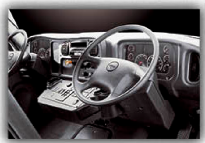
Interior featuring the sit-down dual drive option

The Freightliner M2 trucks can be ordered with an all-wheel drive option and several combinations of axles and suspension for optimized performance. Available on the M2 106 and 108SD, the sit-down and stand-up dual drive option is an easy-to-use feature that allows smooth transitions from left-to-right-hand drive operations. Installed by Fontaine Modification, the right-hand-drive option is ideal for use in refuse collection, road striping, street sweeping and other specialized applications.