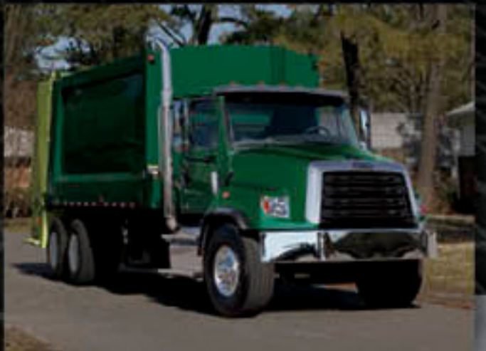
114SD Set-back Axle