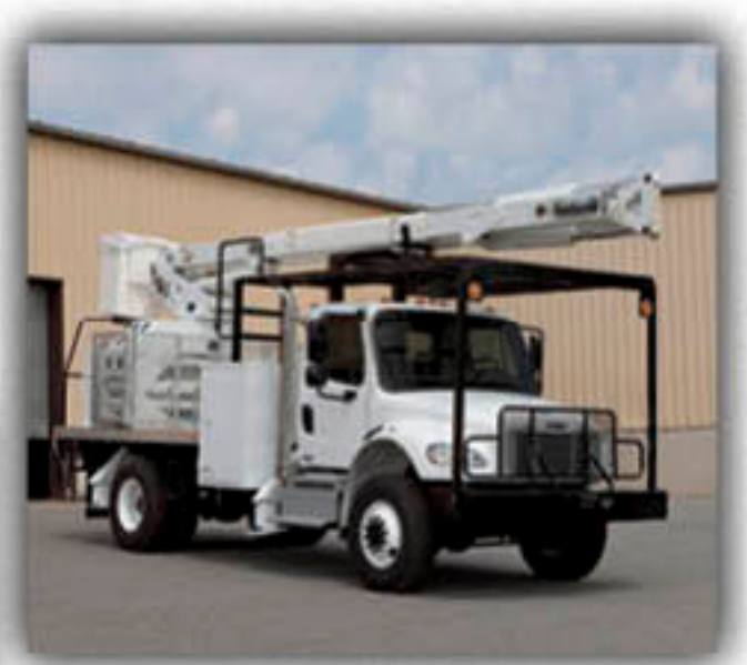
The all-wheel drive option available on M2 106 and 108SD models optimizes off-road performance