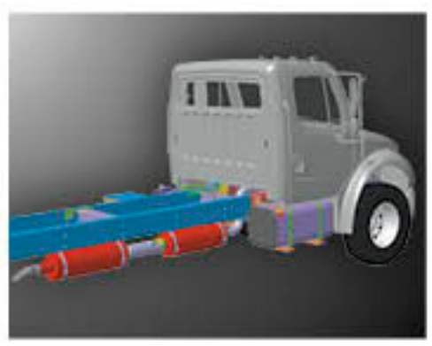
CLEAR UNDER-CAB TAILPIPE