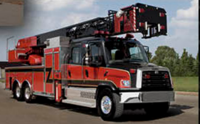
114SD Set-back Axle