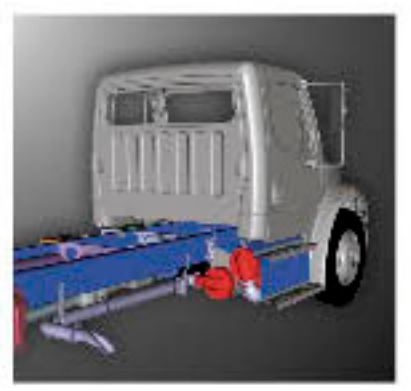
CURBSIDE EXIT TAILPIPE